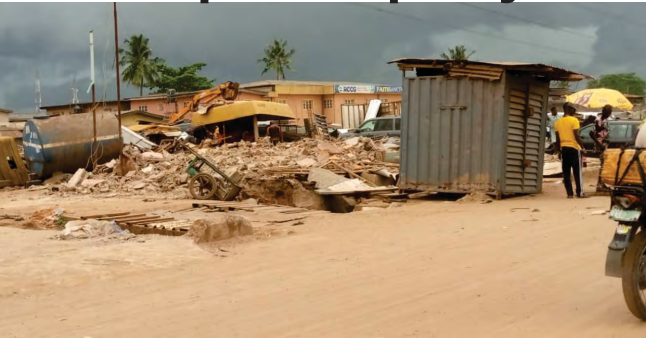
A section of the demolished Power line shops in Ejigbo