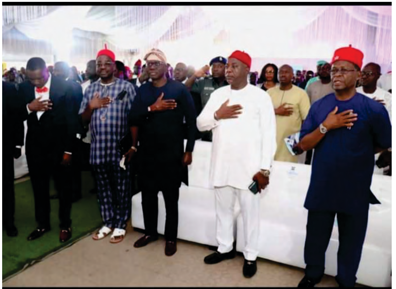
Governor Babajide Sanwo-Olu in a group picture with Ndigboamaka Progressive Market Association leaders