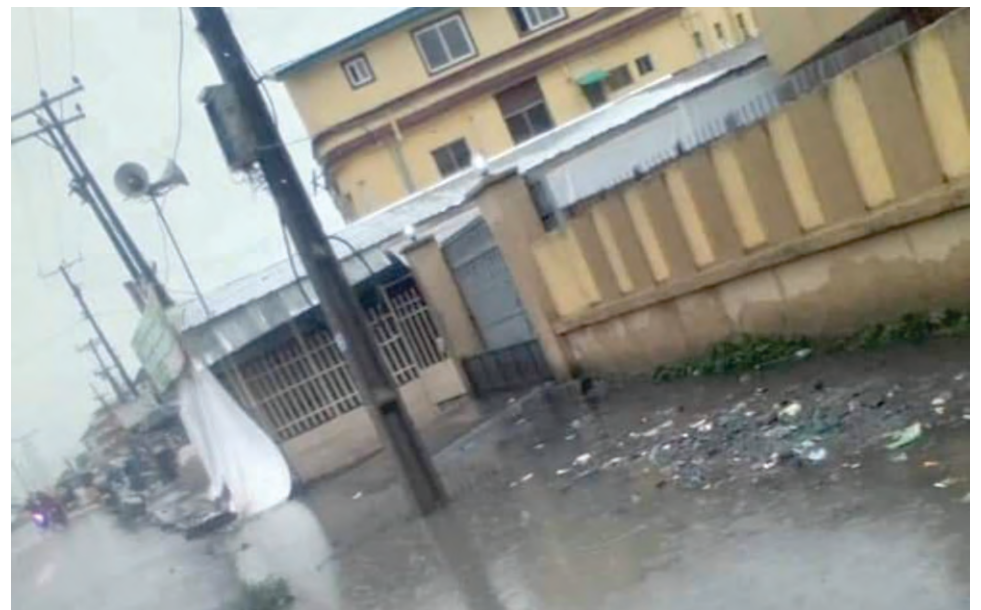
A section of one of the affected areas in Agege LGA

Rasheed, therefore, implored residents to properly distill their refuse and sewages as it has been noticed that improper distilling of refuse have blocked available drainages in the affected areas.