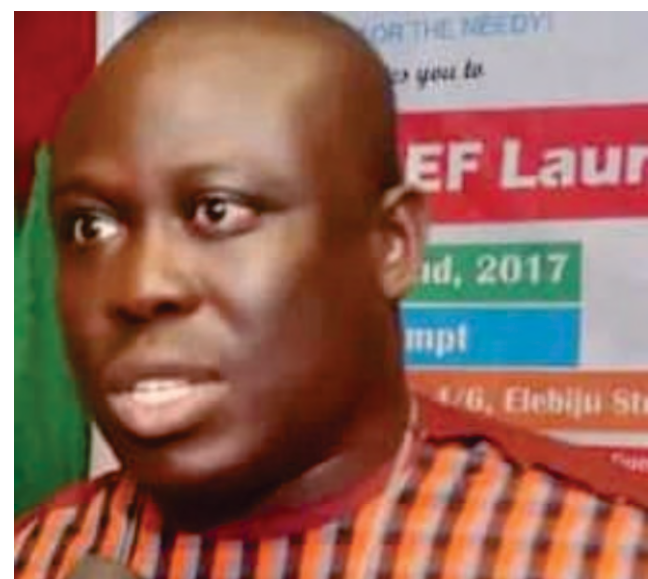
Hon. Samuel Adebayo

Recently, he shared N25,000 each to 20 beneficiaries and 20 bags of