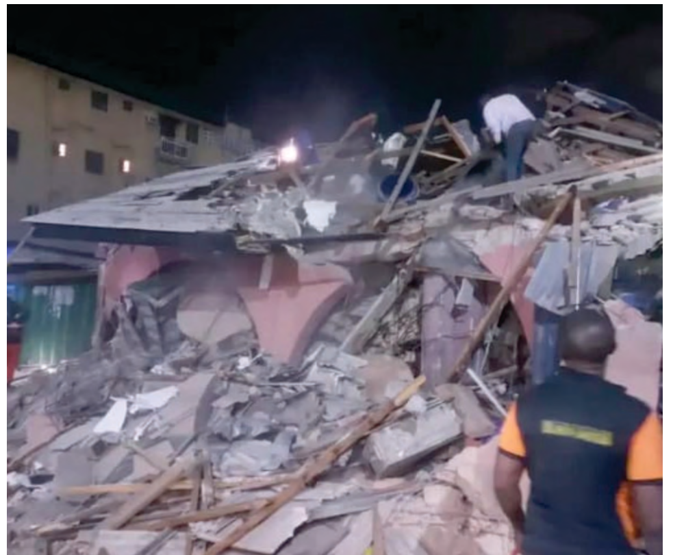
Collapsed three storey building in Ebute Meta