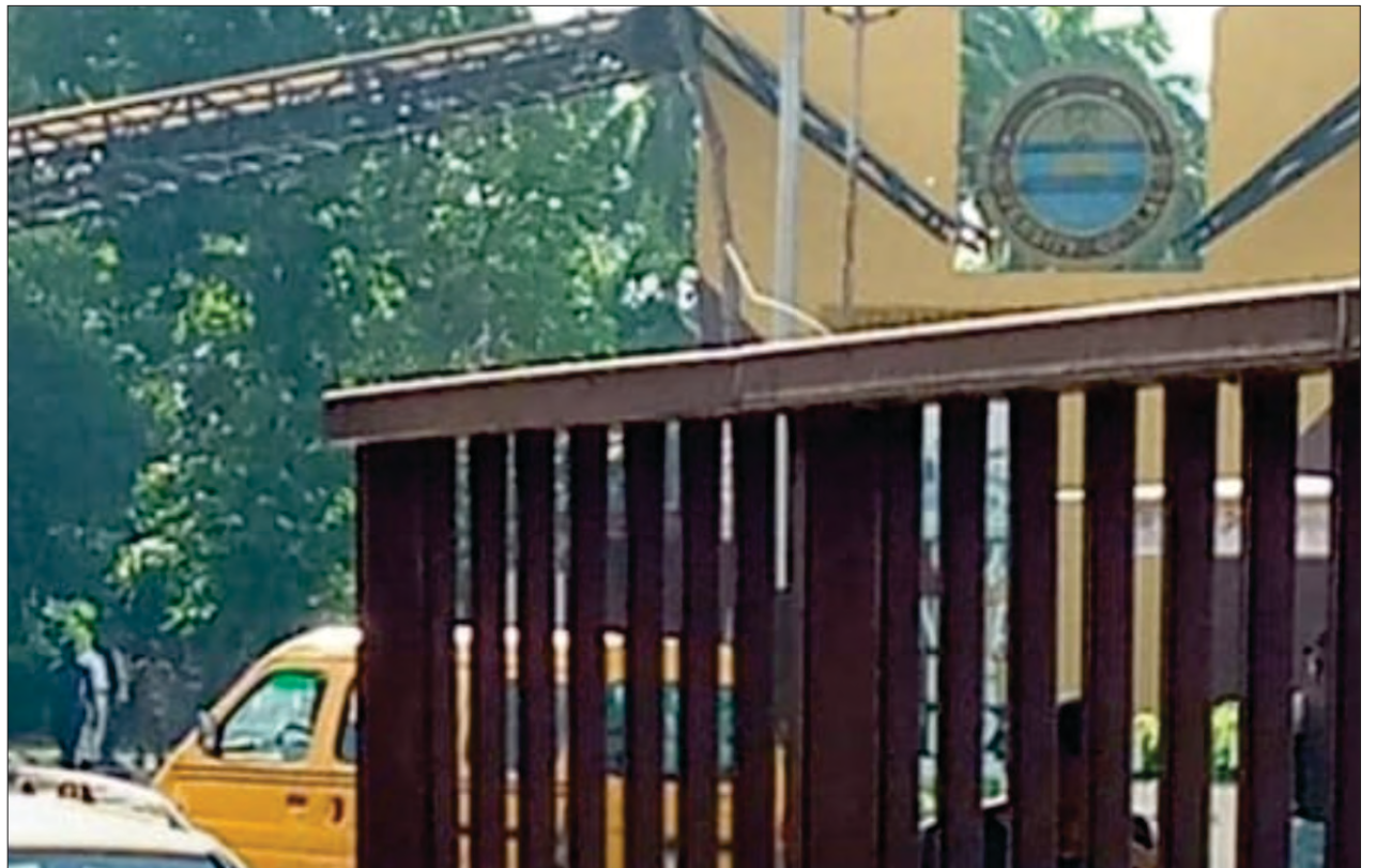
UNILAG gate during protest

ASUU had accused the government of poor commitment to the payment of academic earned allowance; the continued use of the Integrated Personnel Payroll Information System and refusal to adopt the Universities Transparency and Accountability Solution, among others.