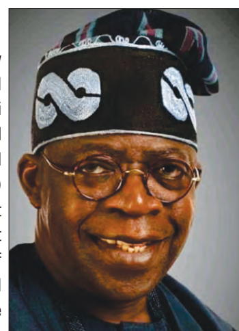
Asiwaju Bola Tinubu

"Our prayers are that he becomes the next president of Nigeria. He has trained a lot of politicians including ministers, governors, senators, reps etc. We pray that he becomes the best president Nigeria ever had. He has turned