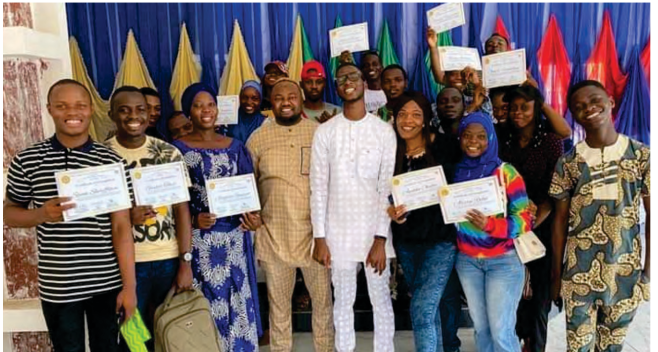
Beneficiaries of Agege Digital Skill Training