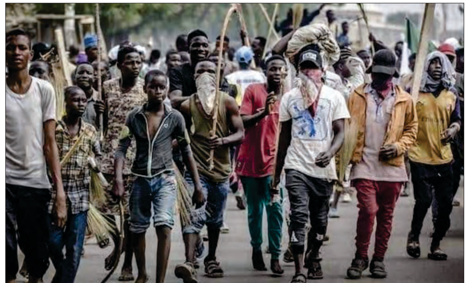
Agege youths on the run

"I appeal to the perpetrators to stop the violence and allow government to address their problems."